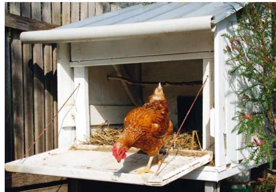
A hen emerges from her nesting box for a morning forage.