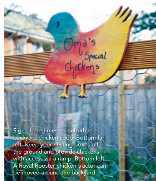
Sign of the times – a suburban backyard chicken coop. Bottom far left: Keep your nesting boxes off the ground and provide chickens with access via a ramp. Bottom left: A Royal Rooster chicken tractor can be moved around the backyard.