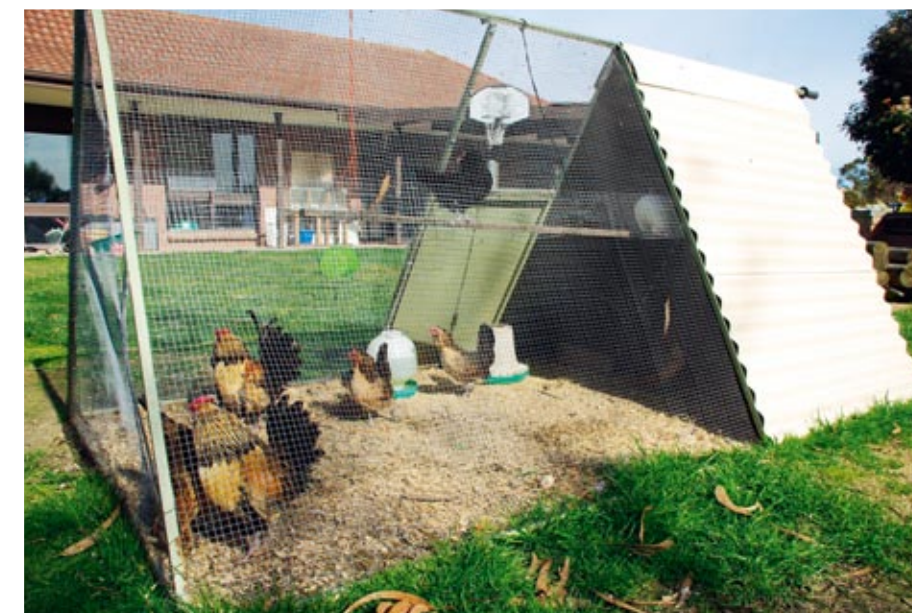
This simple A-frame chicken coop is easy to make.

C hickens clucking in the garden and children hunting for eggs before breakfast... Who needs a tree-change when you can enjoy the good life in your own urban backyard? Once considered the domain of farmers, chooks are finding their way into city and suburban gardens, and they're proving more suited to urban living than most pets.